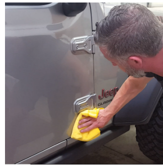
Buff after rainbow appears.