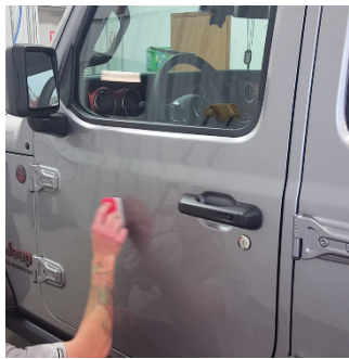
Work chemical into the paint.