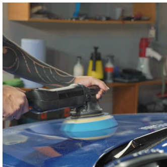
Clean, clay and polish your car.

Discard the microfiber applicator. It is a single-use item that will harden as it dries when used with NS 1500. Also discard the towel used to wipe off the excess coating.