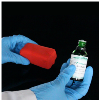
Apply drops on the applicator.